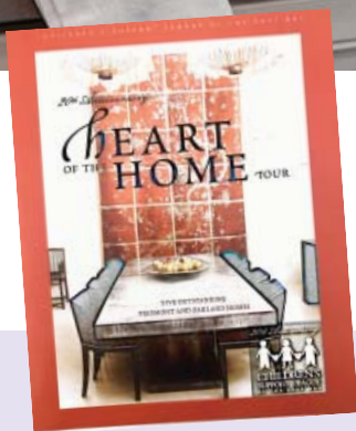
2008 Tour Book